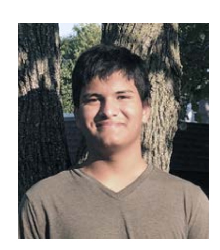
Jesus Age: 15

"Adoption means that I wouldn't have to wonder where I'm going next."